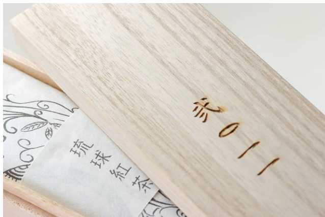
Okinawa Tea Factory Co.,Ltd (Japan 日本) 展位編號 Booth No.: 3G-A21

Jyudan indicates the first prize winner in the All Japan Tea judging competition. The tea leaves are selected by professionals and blended by our original method.