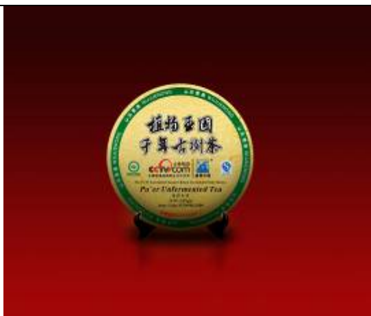
Wujuenong Tea Company Limited 吳覺農茶葉有限公司 (Hong Kong 香港) 展位編號 Booth No. : 3F-F25

“Jin Jian Yaxi” is a fully-fermented black tea, produced by Ya’an Tea Factory in Sichuan, China. Ya’an Tea Factory has a long history of 460 years. Tibetan tea has a mellow flavour and contains 500 healthy organic substances of great benefit to the human body.