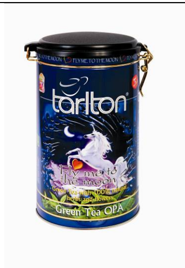
Venture Tea (Pvt) Limited (Sri Lanka 斯里蘭卡) 展位編號 Booth No.: 3F-F12

The Farm is also open to the public to promote agri-tourism.