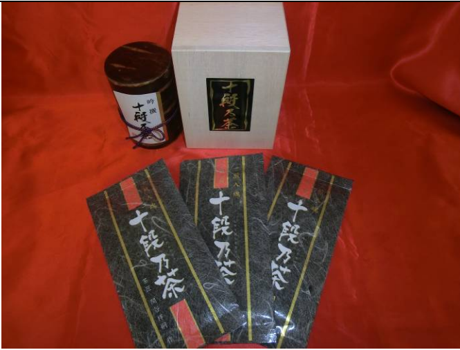
Miyazaki Keizairen Chokuhan Co.,Ltd (Japan 日本) 展位編號 Booth No.: 3F-F18