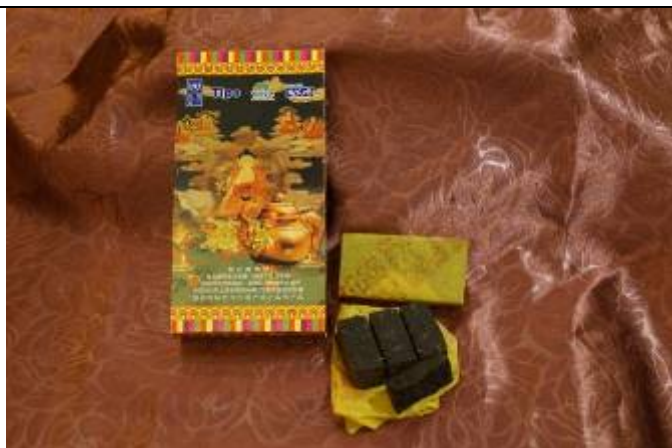
Universal Quality Company Ltd 品宇有限公司 (Hong Kong 香港) 展位編號 Booth No. : 3F-F07