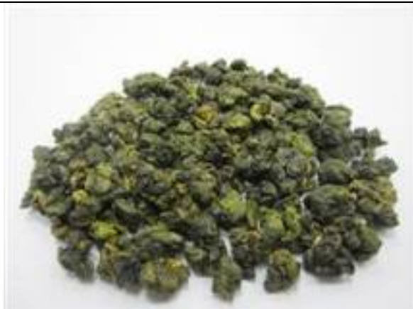
Boonrawd Farm Co., Ltd (Thailand 泰國) 展位編號 Booth No. : 3G-A13